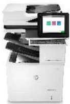
HP LaserJet Managed Flow MFP E62665z