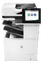
HP LaserJet Managed MFP E62665hs