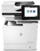
HP LaserJet Managed Flow MFP E62665h

Dynamic security enabled printer. Only intended to be used with cartridges using an HP original chip. Cartridges using a non-HP chip may not work, and those that work today may not work in the future. http://www.hp.com/go/learnaboutesupplies