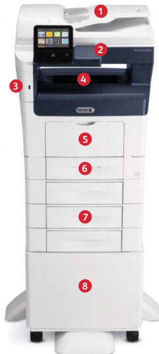
Xerox® VersaLink® B405 Multifunction Printer Print. Copy. Scan. Fax. Email.