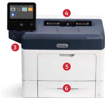
Xerox® VersaLink® B400 Printer Print.