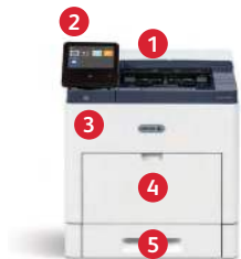
Xerox® VersaLink® B600 Printer Print.