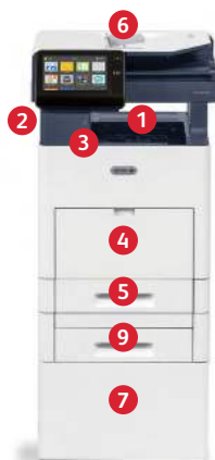
Xerox® VersaLink® B605 Multifunction Printer Print. Copy. Scan. Fax. Email.